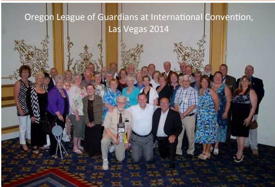
Oregon League of Guardians at International Convention, Las Vegas 2014